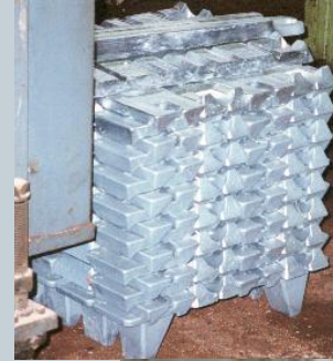
Zamak Die Casting